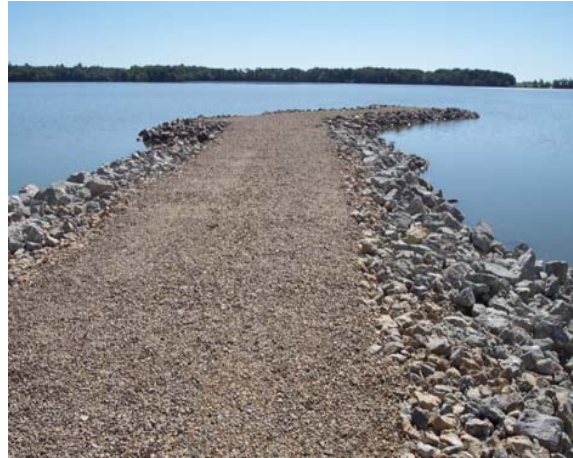
New Fishing Jetty at Silver Lake (funded with fish habitat stamp monies)