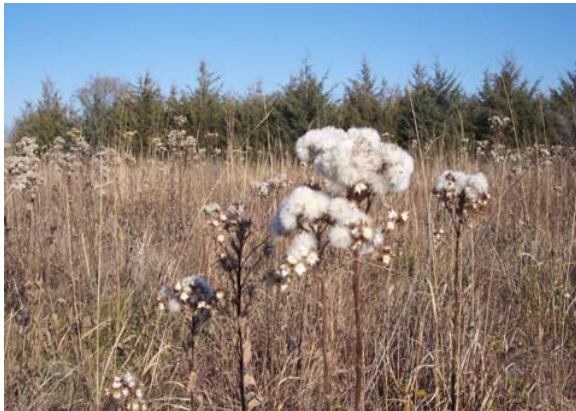
Habitat at Land of Two Waters