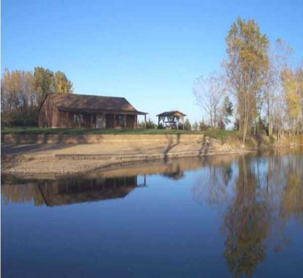
Shelter at Kuennens Quarry

On August 26, 1958 the Worth County Conservation Board held its first monthly meeting. The Board meets on the first Thursday of every month at 7 PM at the conservation board office. The meetings are open to the public. The office is located at 503 1st Ave N in Northwood. The phone number is 641-324-1524 and e-mail address is wccb@worthcounty.org.